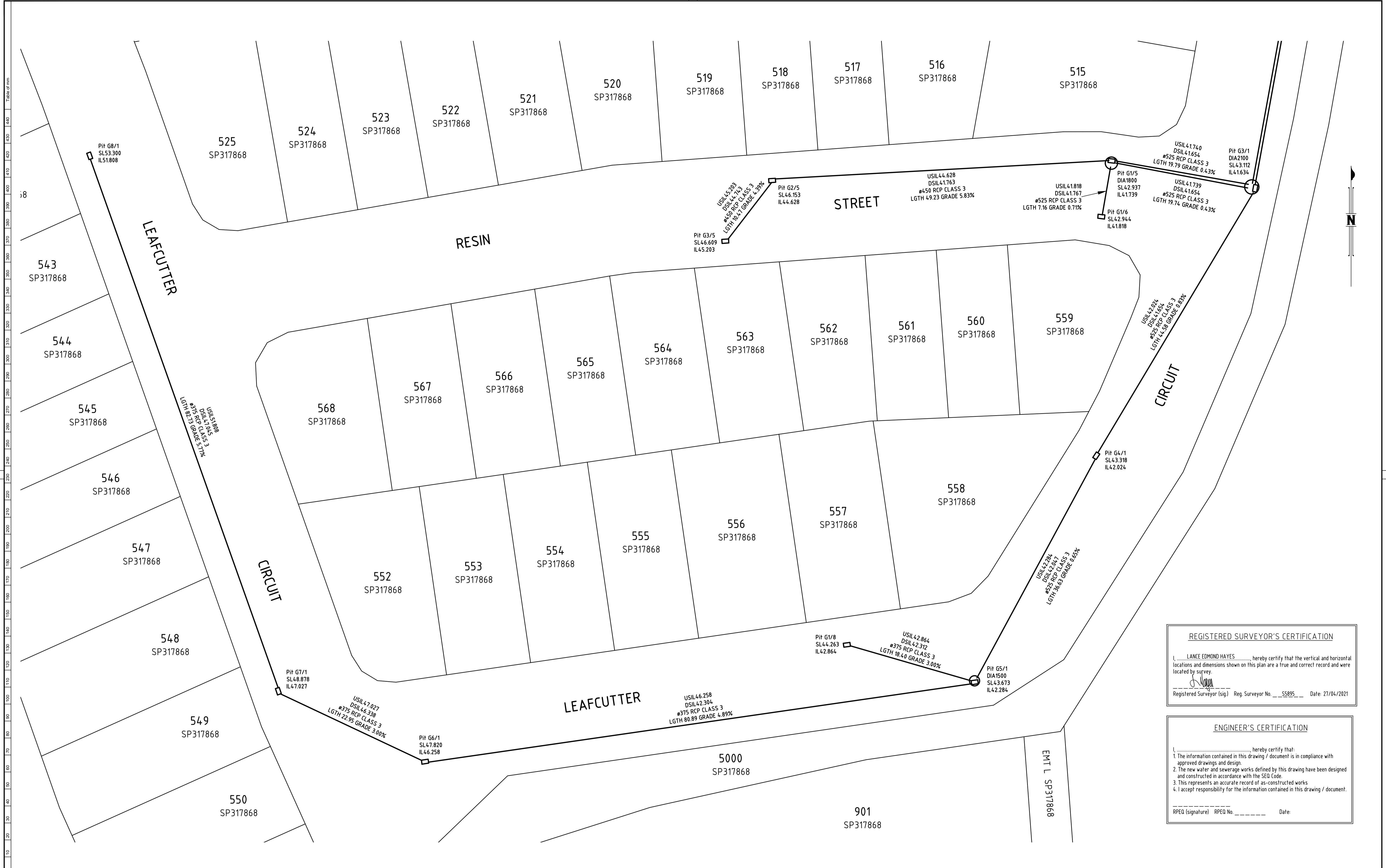
Table of mm 10 20 30 40 50 60 70 80 90 100 110 120 130 140 150 160 170 180 190 200 210 220 230 240 250 260 270 280 290 300 310 320 330 340 350 360 370 380 390 400 410 420 430 440